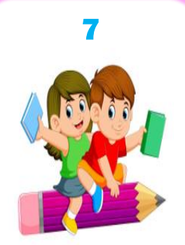
English Writing Practice